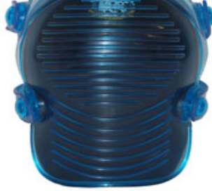
Dead On 97000 Concrete GEL Flexible Knee Pads On Sale $16.94